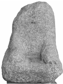
Figure 3: Rectified picture of the front face of the red sphinx from the Opened Air Museum of Alexandria