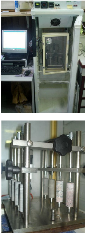
Figure 5: Equipment used for dilation acquisition data = Climatic chamber (T°C cycling) and Inductive displacement sensors (accuracy = 0.35 µm)