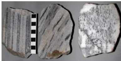
Figure 2: The most representative and widely found varieties of "Greco scritto" from the Cap de Garde quarry.

Concerning Djemila , some of the analyses of the samples collected on the ancient site and outcrops and quarries during the first mission of the end of 2006 are still in progress. About the ornamental stones, the imported coloured marbles and stones were recognized: serpentino , cipollino verde , rosso antico , breccia di settebasi , verde antico , from Greece; giallo antico , alabastro a pecorella , greco scritto , from North Africa; granite misio and africano from Asia Minor are the marbles identified both in public buildings and private houses. As regards the study of the grey marbles looking as the so-called "greco scritto" (Fig. 2), a complete mineralogical-petrographic and geochemical characterization of the marble was conducted. The data bank relating to the quarried material, created here for the first time, was used to verify its origin. The results of this archaeometric study support the hypothesis that the "greco scritto" used in the Roman Mediterranean originated from different sites, and suggest the existence of a larger number of North African quarries, also in the vicinity of Annaba.